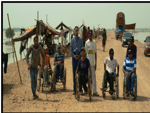
Russia Today with SSP team in field