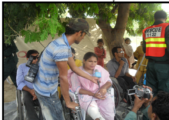
DAWN NEWS (Channel)