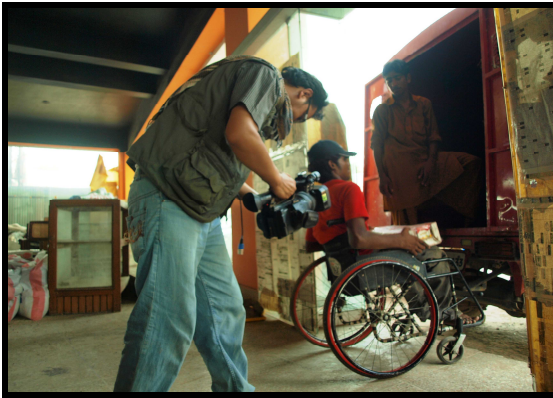
Russia Today RT International Channel