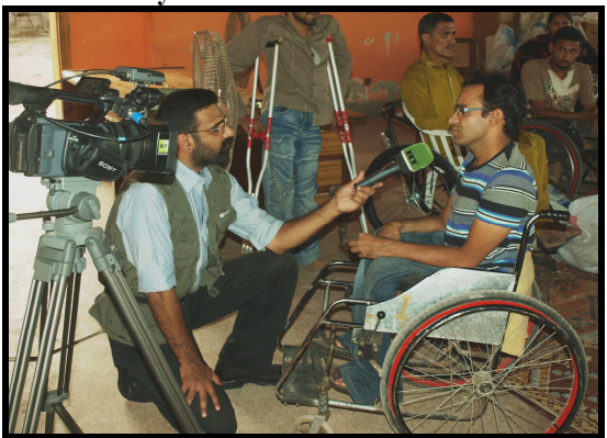
Russia Today RT International Channel