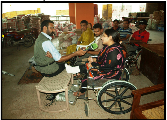
Russia Today RT International Channel